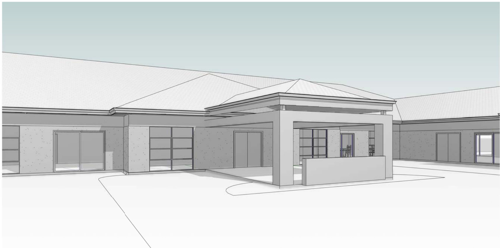
2 PERSPECTIVE 2