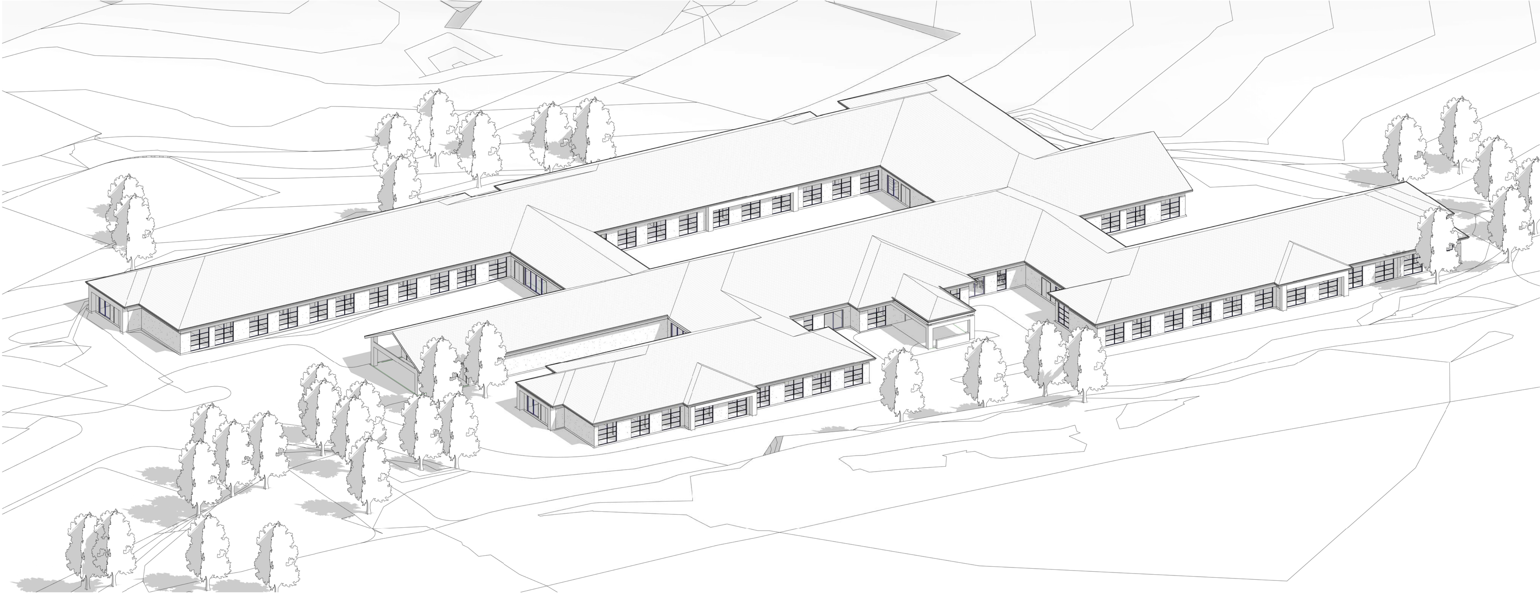
1 PERSPECTIVE 1