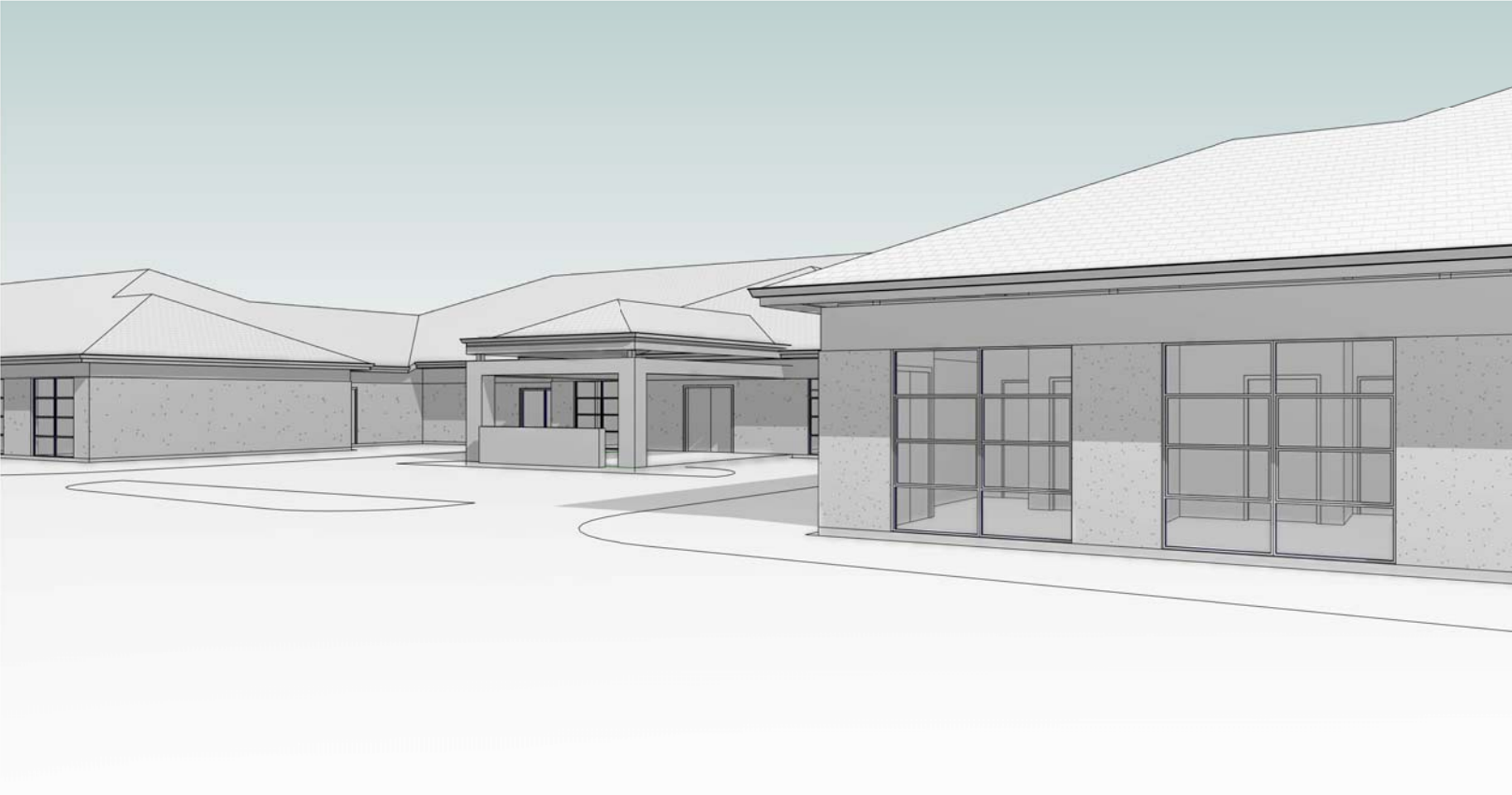
4 PERSPECTIVE 4